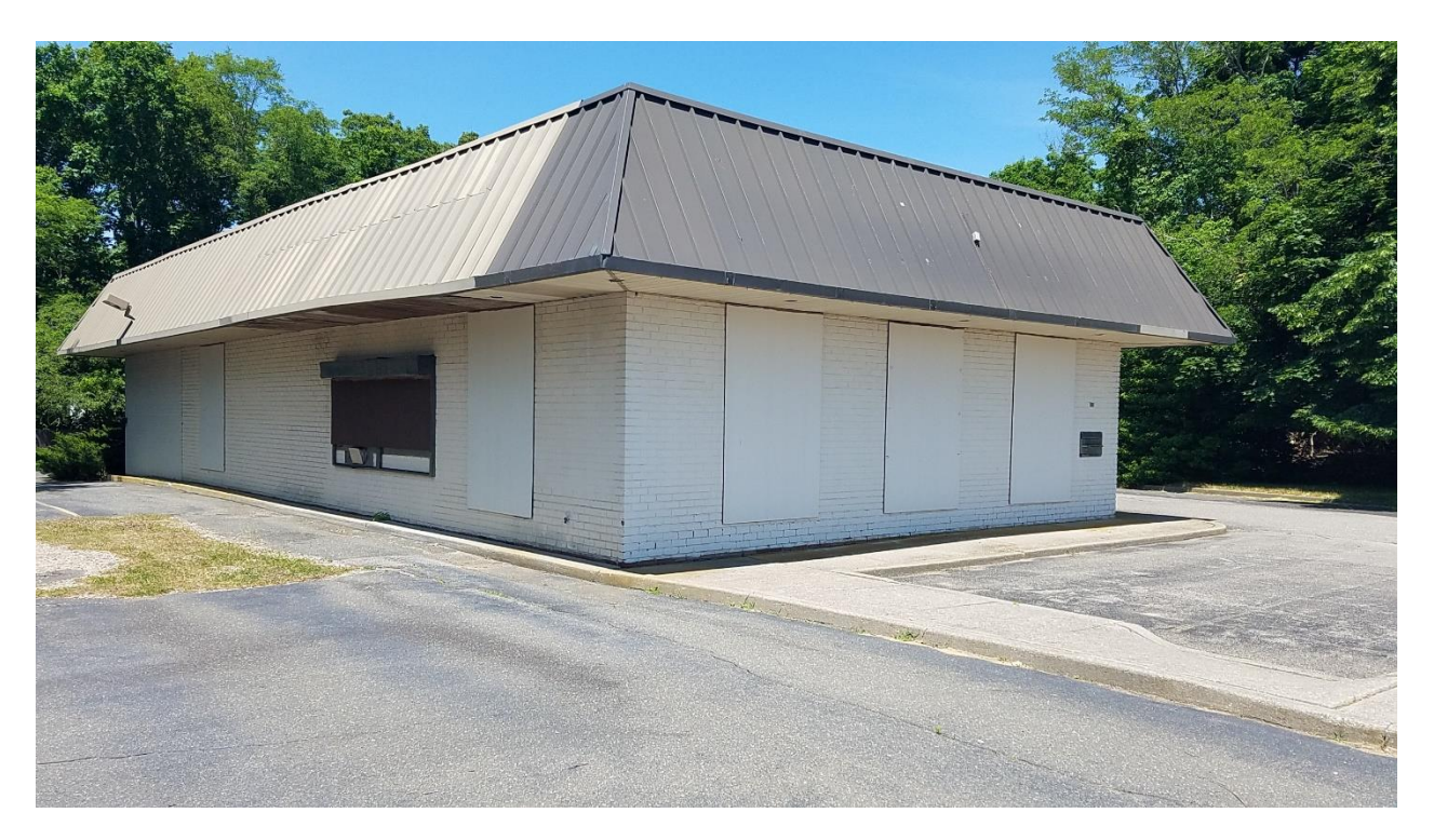
2,730 SF Building with Drive Thru and Full Basement 8' Finished