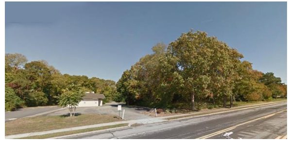
2,700 SF Building with Full Basement The Two Parcels are Severable

Paul@RestaurantExpert.com www.RestaurantExpert.com